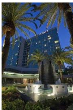
2013 All Hands Meeting Tampa Bay Grand Hyatt

Shell Exploration & Production EPA Gulf of Mexico Program Hach Hydromet Harte Research Initiative LA Coastal Protection & Restoration Authority AL Dept of Conservation & Natural Resources Dauphin Island Sea Lab Northern Gulf Institute The Nature Conservancy NOAA Gulf of Mexico Regional Collaboration Team Mission-Aransas NERR GCOOS Gulf National Estuary Programs Florida Institute of Oceanography Ocean Conservancy CSA Ocean Sciences JHT Inc. Chevron